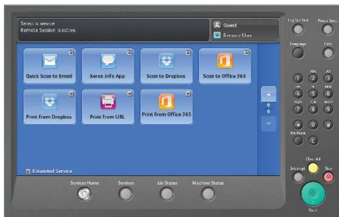
User Interface showing Xerox® ConnectKey Apps.